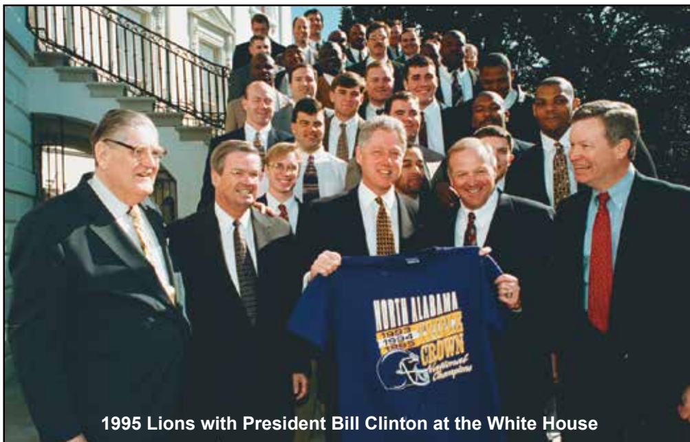
1995 Lions with President Bill Clinton at the White House